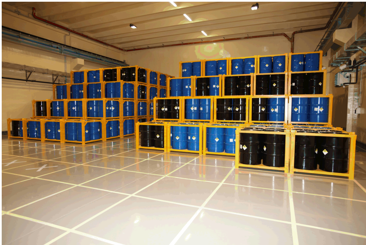
Figure 2.5-1: Operation hall of the technology building