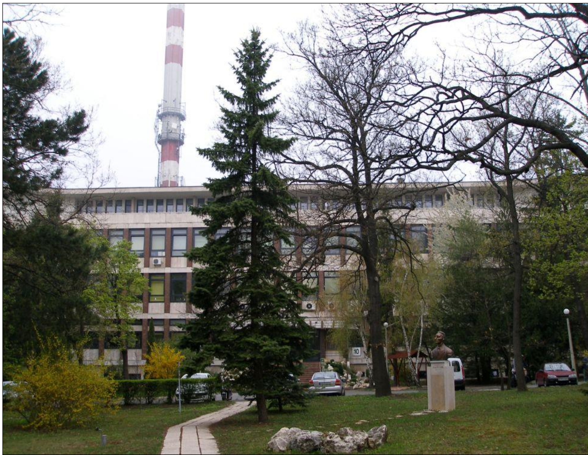
Budapest Research Reactor