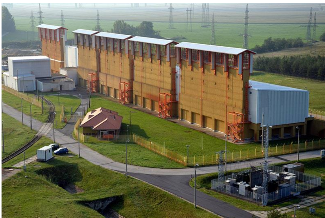
Figure 2.2-1: SFISF bird view

It can be stated that the nuclear safety level of the nuclear facility in 2018, in comparison with 2017, increased in the area of „Smooth operation”, while remained green in the areas of „Operation with low risk” and „Operation with a positive safety attitude”.