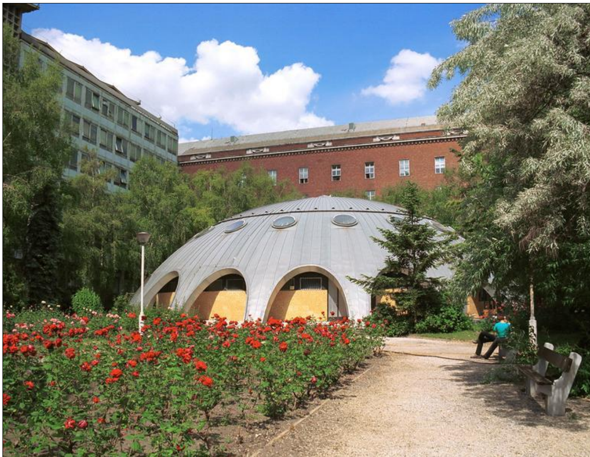
Training Reactor