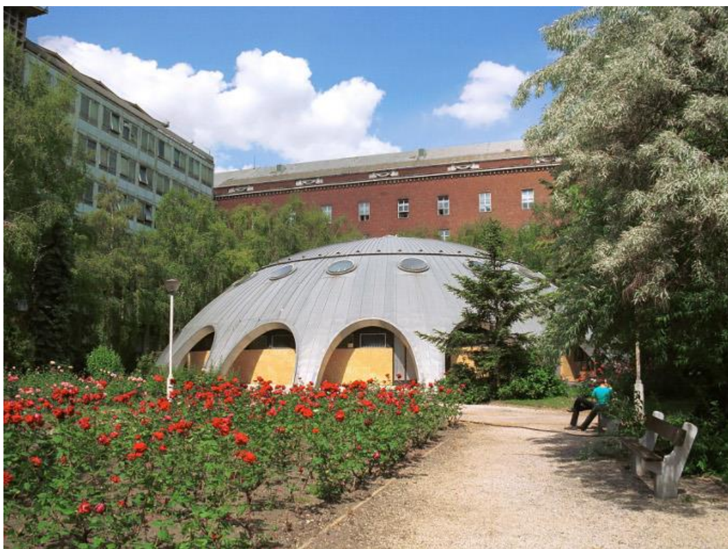
Figure 2.3-1: Budapest University of Technology and Economics, Training Reactor

It can be summarised about the safety performance that the area of „operation with low risk” is continuously good for years, the area of “smooth operation” and “operation with a positive safety attitude” area moved from the authority acceptable range and the range that requires authority action (in 2017) and reached good qualification.