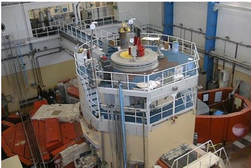
Figure 2.4-1: Budapest Research Reactor

Based on the qualification of the safety performance indicators, it can be concluded that in 2017 the warning qualifications in the area of “smooth operation” indicated an increasing number of technical issues caused by ageing of the research reactor. In 2018, the value of each indicator and attribute was green. Accordingly, both the licensee and the authority shall pay more attention on the ageing management activities in order to prevent the appearance of failures. The area improved compared to the level of the preceding year with 2 improving indicators. The “operation with low risk” area held its flawless performance. Due to the warning qualifications in the area of “operation with a positive safety attitude” the licensee has to improve the compliance with regulatory requirements and decrease the human error induced reportable events, while the authority has to pay special attention to the enhancement of the level of safety culture within the organisation of the Licensee. The third area kept the level of the preceding year with 2 improving and 2 degrading indicators.