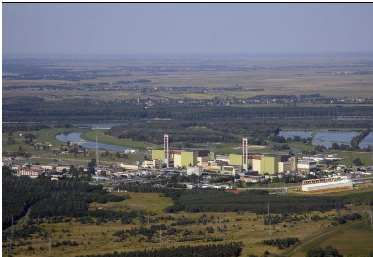
Paks Nuclear Power Plant