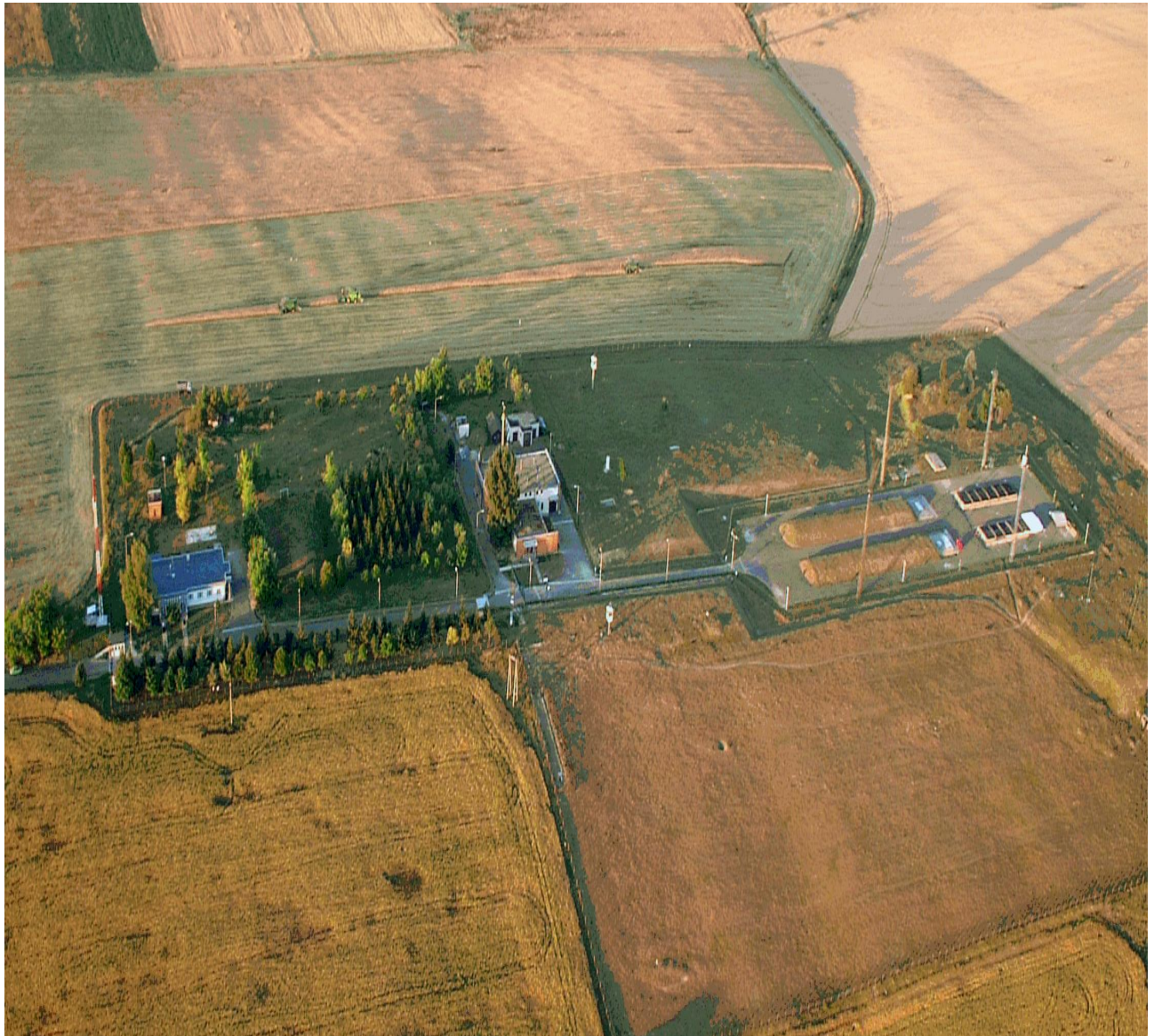
Figure 2.6-1: Bird view of the Radioactive Waste Treatment and Disposal Facility