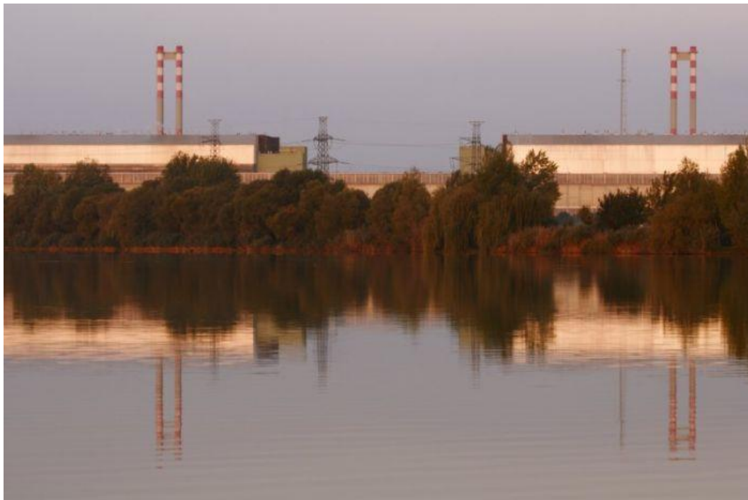
Figure 2.1-1: View of Paks Nuclear Power Plant

Based on regulatory authorisation, Paks Nuclear Power Plant modified the earlier used Technical Specifications (hereinafter referred to as TS), it has commenced the application of the Operational Limits and Conditions (hereinafter referred to as OLC) since October 24, 2018. In this report, in relation to the Paks Nuclear Power Plant, the TS is meant as OLC since then.