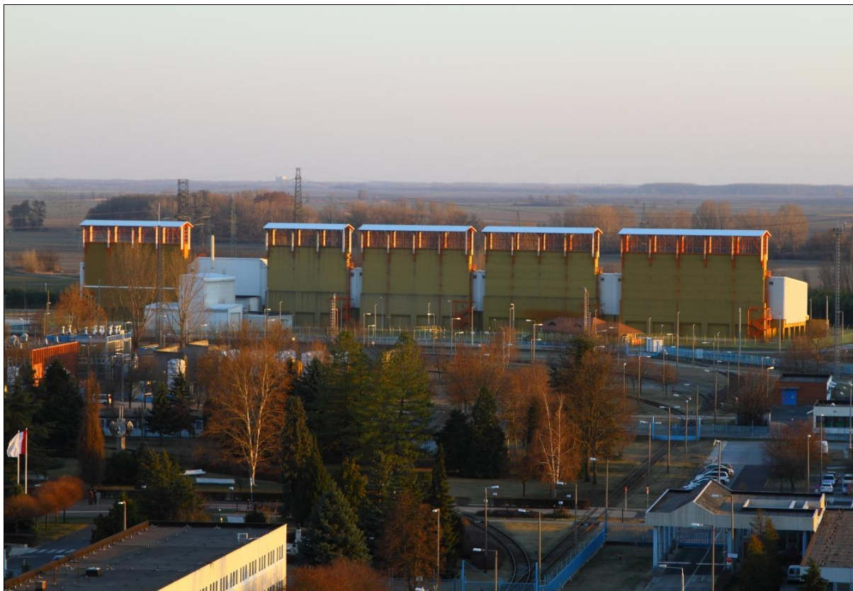
Spent Fuel Interim Storage Facility